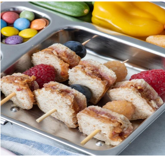
The Giving Emphasis for July is Camp La Verne

Thank you for your continued response in our effort to support the local food bank. Our food emphases for July are Lunch Box, kid friendly, Food and School Supplies . Peanut butter, jelly, jam, honey, crackers, bread, fruit snack, dried fruit, & rice cakes are wonderful lunches that all ages can put together. For all canned food please provide Pop-Top cans if possible. As always, staple items, including spices, baking items like flour baking soda, yeast, diapers, formula, socks and feminine product are always needed and welcome.