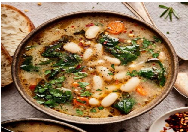
The Giving Emphasis for August is Habitat for Humanity.

Thank you for your continued response in our effort to support the local food bank. Our food emphases for August are beans of all kinds and all things tomato except fresh tomatoes. Bean soup, bean dip, bean salad, refried beans, and sprouting the dry beans to grow bean sprouts are all delicious ways to use beans. Marinera sauce, sliced tomatoes with cheese, salad, sandwiches, and stuffed tomatoes are ways ways add tomatoes to your meal. For all canned food please provide Pop-Top cans if possible. As always, staple items, including spices, baking items like flour baking soda, yeast, diapers, formula, socks and feminine products are always needed and welcome.