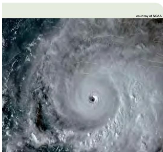
A satellite image of Hurricane Melissa