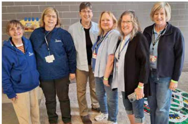
The CDS Critical Response Childcare team at work in New Orleans.

In another recent CDS response, the Critical Response Childcare team served in New Orleans, La., following the truck attack of Jan. 1 that killed 14 people and injured 35 others in a crowd on Bourbon Street. The Critical Response Childcare program offers specially trained volunteers following mass casualty events.