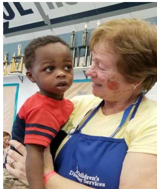
CDS Volunteer in Chico, California

In the last few years, CDS volunteers have responded to the needs of children in several states during wildfires. These have included the 2023 wildfire in Lahaina, Maui, Hawaii, where 13 CDS volunteers served 457 children during 6 weeks of deployment; the Marshall Fire in Lafayette, Colo., in January 2022, serving 25 children; and in 2021, 3 wildfires in Santa Clara and Oroville, Calif., and one in Boulder, Colo. In 2018, CDS responded with three separate teams to the Camp Fire that destroyed the town of Paradise, Calif.