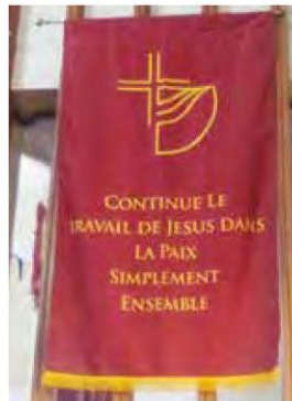
While in Florida, district executives and other denominational leaders joined in Atlantic Southeast District’s first Multicultural Festival.